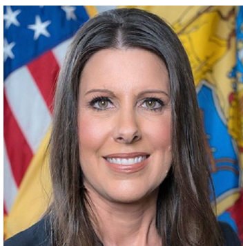
COMMISSIONER VICTORIA KUHN N.J. DEPARTMENT OF CORRECTIONS